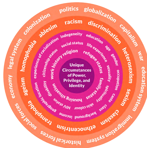
Intersectionality Displayed in a Wheel Diagram [Digital Image]. Women Transforming Cities. https://www.womentransformingcities.org/intersectional-feminism . (Adapted from the Canadian Research Institute for the Advancement of Women, 2009). Reprinted with permission.

A framework developed by Kimberlé Crenshaw (1989) and that describes how all people have multiple, connected social identities that interact with broader contexts to create privileges and/or disadvantages. The Canadian Research Institute for the Advancement of Women has developed a visual aid depicting intersectionality. In this diagram, “the innermost circle represents a person’s unique circumstances, the second circle aspects of the individual identity, the third different types of discrimination and attitudes that affect identity, and the outer circle larger forces and structures that work to reinforce exclusion” (Women Friendly Cities Challenge, n.d.).